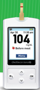
OneTouch Verio IQ® meter