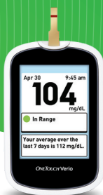
OneTouch Verio® meter