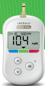
OneTouch Verio Flex® meter

Everyone manages diabetes differently. That is why the OneTouch® brand offers you a choice of products to best fit your lifestyle. As the preferred* diabetes testing products with WellCare, OneTouch® brand offers the best coverage on your drug benefit, which means you receive our meter at no charge.